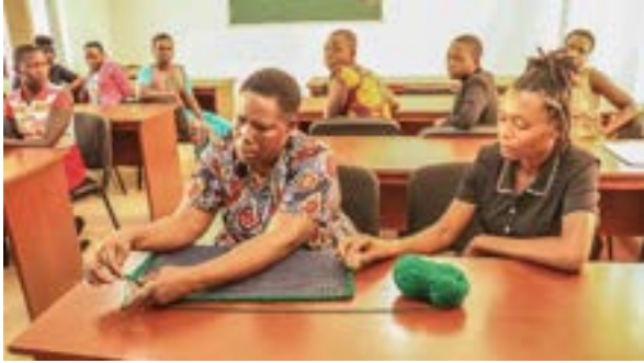
Beginning the journey of skilling each student in her own world