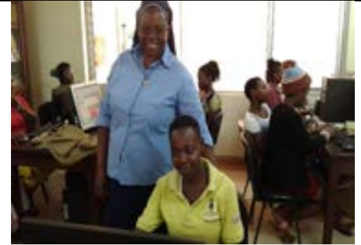
Designing cards ad advert information for their businesses

AFTER ONE MONTHS TRAINING BELOW ARE SAMPLES OF THEIR PRODUCTS. (door mats different dishes)