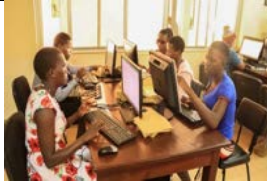
Practical Hands-on learning