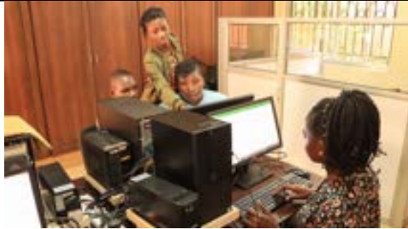
Computer instructor with the computer literacy class Groups are instructed in rounds