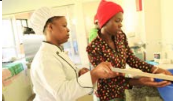
Instructor with students in cookery