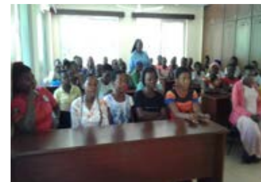
Orientation of the new entrants